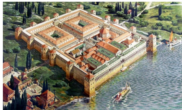
Fig. 3.2. Split ( http://www.stagcrewcroatia.com/split )