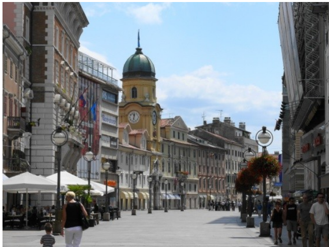
Fig. 3.6. Rijeka ( https://en.wikipedia.org/wiki/Rijeka )

Departure to Rijeka and Zvir spring (2 hours drive). Karst spring Zvir is one of the largest permanent karst springs in Croatia. Its discharge capacity varies between 0.9 and 7.5 m 3 /s, and is captured for the water-supply of the city of Rijeka, the third largest city in Croatia. Near the spring Zvir, water intake gallery Zvir II was built with an additional 0.5 m 3 /s for the water-supply system (Fig. 3.5).