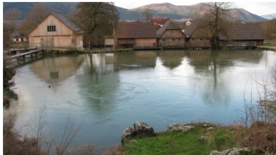
Fig. 3.3 Majerovo vrilo